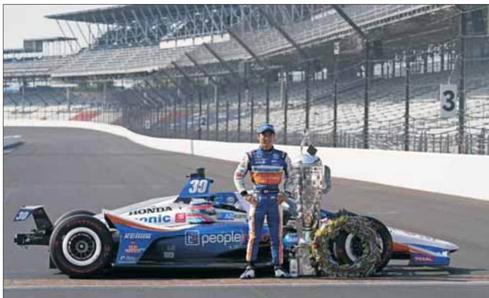
TWO-TIME INDY 500 CHAMP. Takuma Sato of Japan, winner of the 2020 Indianapolis 500 auto race, poses during the traditional winner's photo session at Indianapolis Motor Speedway on August 24, 2020 in Indianapolis.

"Human existence is like this ice," he said. "It melts and becomes water and then merges into a stream. The stream goes into a tributary which flows into a river and then it all ends up in an ocean. Some (rivers) remain pure while others collect dirt along the way. Some (people) help mankind and some become the cause of its devastation."