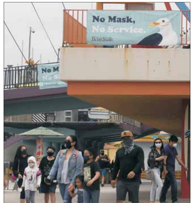
QUARANTINE COMPLICATIONS. People wear face coverings while walking on the Santa Cruz Beach Boardwalk during the coronavirus outbreak in Santa Cruz, California. Californians are being wooed by local tourism boards promising safe and clean lodging, dining, and sightseeing in a bid to boost the state’s devastated economy.