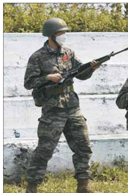
CRACK SHOT. In these undated photos provided by South Korea Marine Corps' Facebook on May 8, 2020, Tottenham Hotspur forward Son Heung-min takes part in drills at Marine Corps boot camp in Seogwipo on Jeju Island, South Korea. Son finished his three-week military training in South Korea and was near the top of the class. but group practice sessions have not yet started.

South Korea's K-League kicked off in May with the defending champion Jeonbuk Motors facing the Suwon Bluewings in the southwestern city of Jeonju.