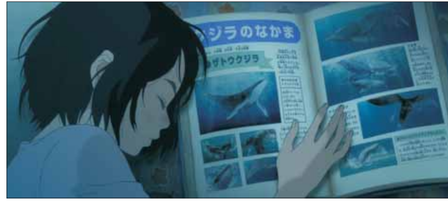
March 6 through 15 Portland\ area\ theaters

Watch a wide-ranging selection of international films at the 43rd annual Portland International Film Festival (PIFF). Highlighting films from dozens of countries, PIFF offers moviegoers a broad multicultural medley of documentaries, feature-length films, and shorts to satisfy nearly any cinematic taste. Some of the films were created in Cambodia, China, Hong Kong, Iran, Japan, Laos, and Thailand. To order advance tickets, call (503) 276-4310. For more information, or to obtain a complete schedule of films and venues, call (503) 221-1156 or visit <www.nwfilm.org>.