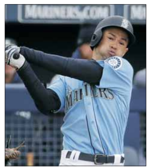
Ichiromania returns to Japan