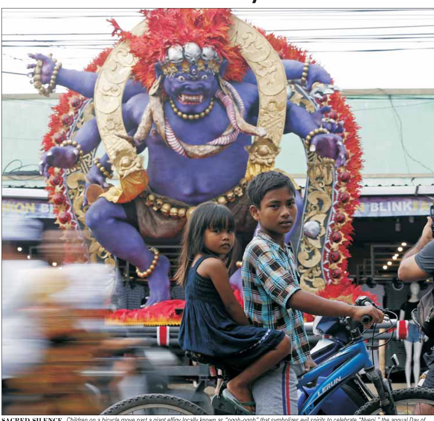
SACRED SILENCE. Children on a bicycle move past a giant effigy locally known as "ogoh-ogoh" that symbolizes evil spirits to celebrate "Nyepi," the annual Day of Silence marking the Balinese Hindu New Year in Bali, Indonesia. Most Balinese practice self-reflection and stay at home to observe the quiet holiday. Tourists visiting the island are asked not to leave their hotels and the airport also is closed.

DENPASAR, Indonesia (AP) — Bali's airport closed for 24 hours, the internet was turned off, and streets emptied as the predominantly Hindu island in Indonesia observed its New Year with an annual Day of Silence.