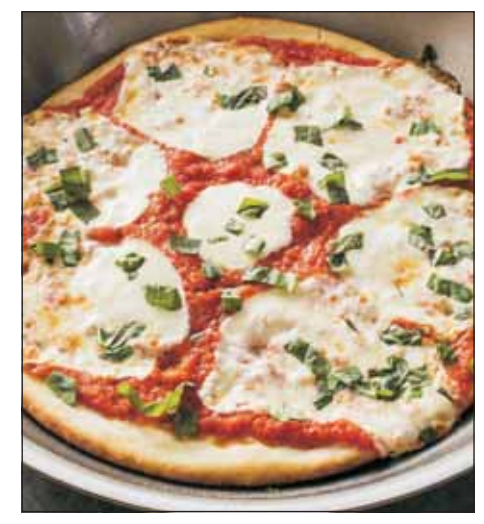
Skip delivery tonight, make pizza at home