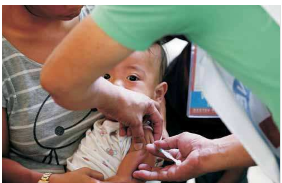
INOCULATION INUNDATION. Philippine National Red Cross and Health Department volunteers are seen conducting house-to-house measles vaccinations of children in Manila, the Philippines. The Philippine health secretary said more than 136, mostly children, have died of the measles and 8,400 others have fallen ill due to the contagious viral disease.