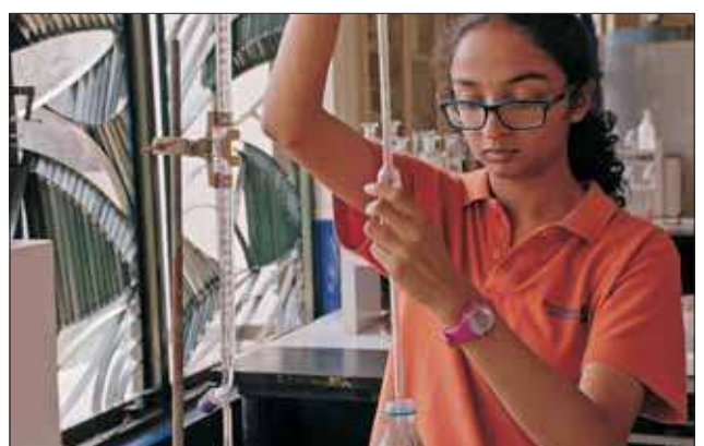
FOCUS ON ASIAN FILMS. The DisOrient Asian American Film Festival takes place March 14 through 17 on the University of Oregon campus in Eugene, Oregon. In addition to numerous screenings, the festival also includes an opening night reception with No-No Boy, a music video, narratives, and a closing night awards gala. Pictured from top to bottom are scenes from Moananuiakea: One Ocean. One People. One Canoe.; For Izzy; and Inventing Tomorrow.

Film Festival, the first film festival in Oregon featuring independent films and video by and/or about Asian Americans. This year's event highlights many films, including Moananuiakea: One Ocean. One People. One Canoe. (March 14), For Izzy (March 15), Hiro's Table (March 16), Me? (March 16), A Letter For Sang-Ah (March 16), Justice For Vincent (March 16), Minding the Gap (March 16), We Are American Soldiers (March 17), Finding the Virgo (March 17), Hoai (March 17), Nailed It (March 17), Liquor Store Babies (March 17), The Traveler Takamura (March 17), and Inventing Tomorrow (March 17). The festival also includes an opening night reception with No-No Boy, a short narrative ( Alternative Facts: The Lies of Executive Order 9066 ), a music video ( Dream of Home ), narrative programs, and a closing night awards gala. For info, or to obtain a full schedule of free and ticketed events, call (541) 954-1798 or visit < www.disorientfilm.org >.