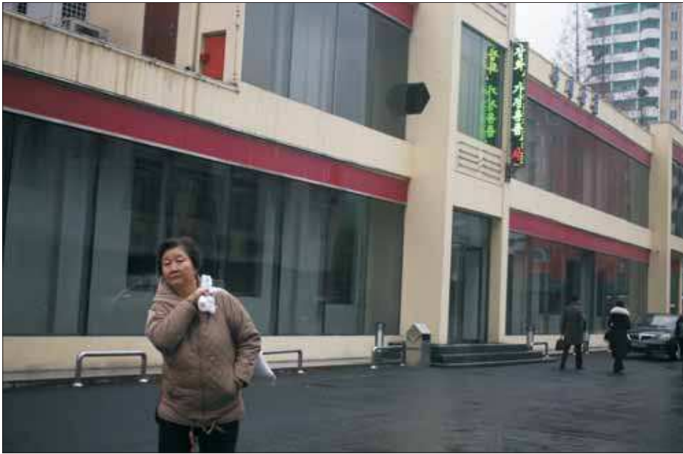
SANCTIONS CIRCUMVENTED. A North Korean woman walks outside Bugsae Shop, one of the stores known as the Singapore shops, in Pyongyang, North Korea. Despite the unwanted publicity of a criminal trial for one of their main suppliers, business is booming at Pyongyang's Singapore shops, which sell everything from Ukrainian vodka to brand-name knockoffs from China.