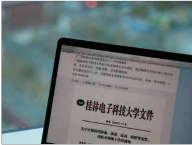
SEARCH BACKLASH. A computer screen shows the leaked online post from Guilin University of Electronic Technology warning of “hostile domestic and foreign powers” that were “wantonly spreading illicit and illegal videos” through the internet in Beijing, China. The Chinese university’s plan to conduct a blanket search of student and staff electronic devices have come under fire, illustrating the limits of the population’s tolerance for surveillance and raising concern that tactics used on China’s Muslim minorities may be creeping into the rest of the country.