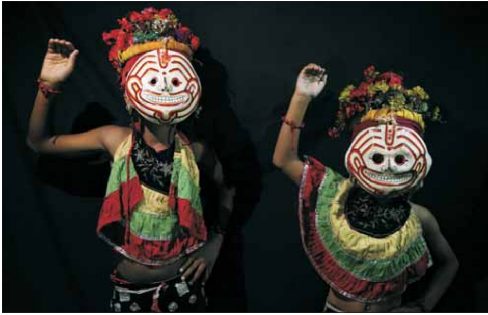
FESTIVAL OF DEITIES & DEMONS. Dancers wearing masks of the god Kawancha pose for photographs in Kathmandu, Nepal. For centuries, Nepal has celebrated the Indra Jatra festival of masked dancers, which officially begins monthlong festivities in the Hindu-dominated Himalayan nation. The dancers, who come from a variety of backgrounds, say they pull off the performance every year despite minimal financial support from the government and other sources.