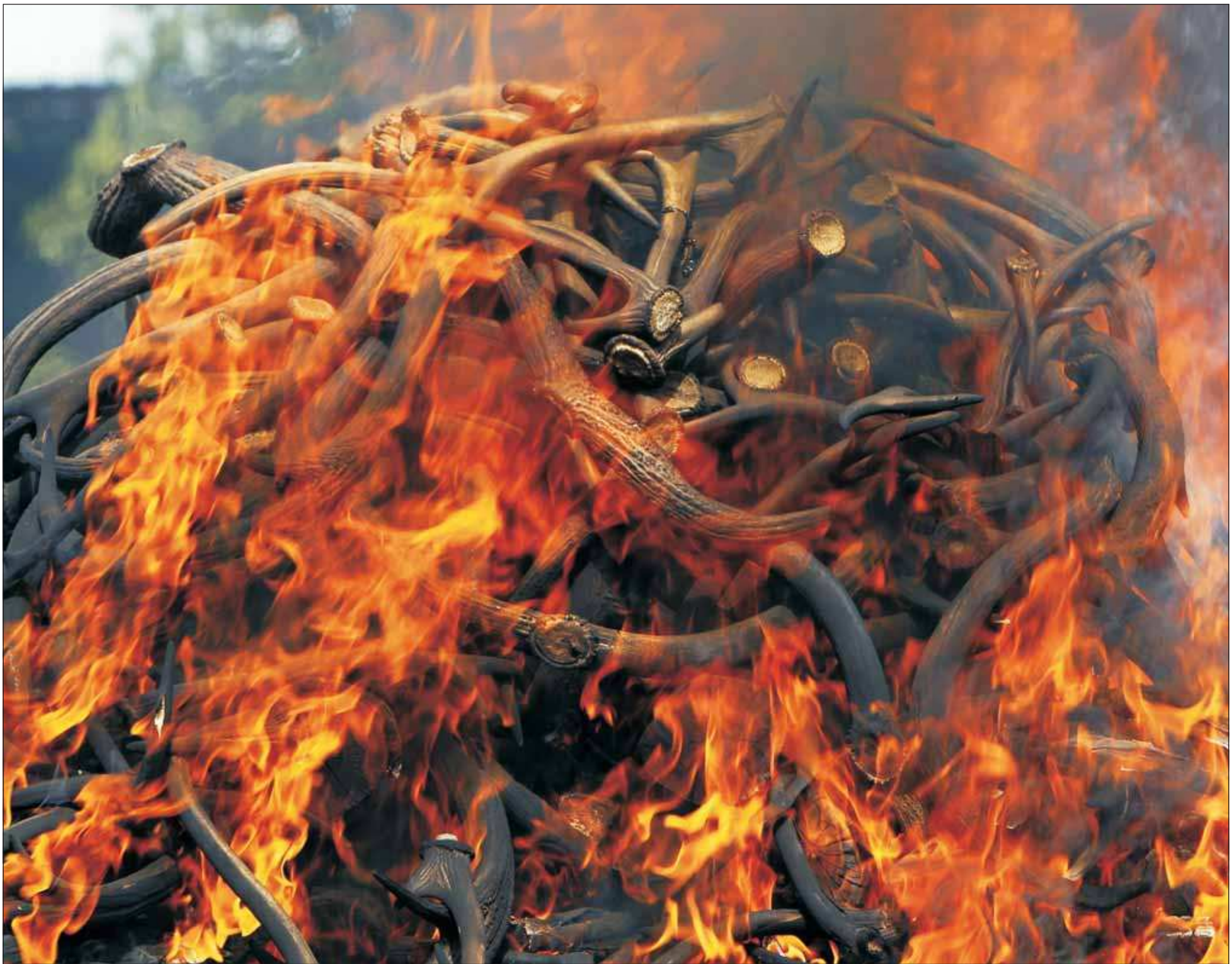
IVORY INCINERATION. Smoke and flames billow from burning wildlife parts during a destruction ceremony of confiscated elephant ivory and other wildlife parts in Naypyitaw, Myanmar. Myanmar's Natural Resources Ministry said the items destroyed at the burning in the capital of Naypyitaw included 277 pieces of ivory, 227 bones of elephants and other animals, 1,544 different horns, and 25 wildlife skins. It said the parts were destroyed to raise public awareness about the illegal wildlife trade, to try to deter such activities, and to promote international cooperation in suppressing the crime. China, the world's largest ivory consumer, banned its domestic trade starting this year in what conservationists hope will relieve pressure on Africa's besieged elephant populations. Another conservation organization, however, has said that rising Chinese demand for products made from elephant skin is also driving poaching, especially in Myanmar. See story on page 5.