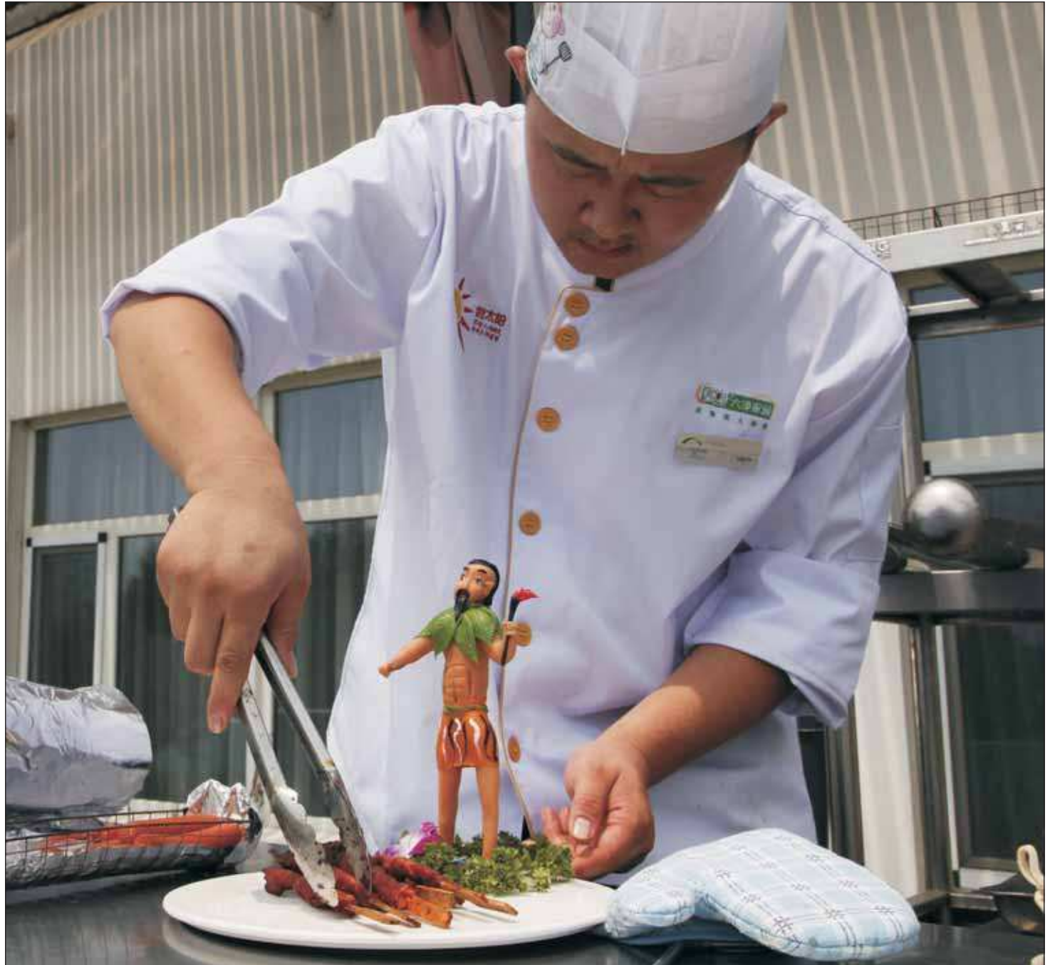
SOLAR VALLEY. A chef sets a plate with food cooked by solar cookers near a mini statue of mythical Chinese archer Houyi who, according to legend, shot down nine suns before harnessing fire for humanity's benefit, in Dezhou in eastern Shandong province, China. Two dozen chefs with white aprons and hats prepared soups, baked "baozi" pork buns, and boiled rice porridge at a festival designed to demonstrate the potential of solar cookers that organizers claim can help reduce climate-changing greenhouse-gas emissions.

By Sam McNeil and Fu Ting The Associated Press