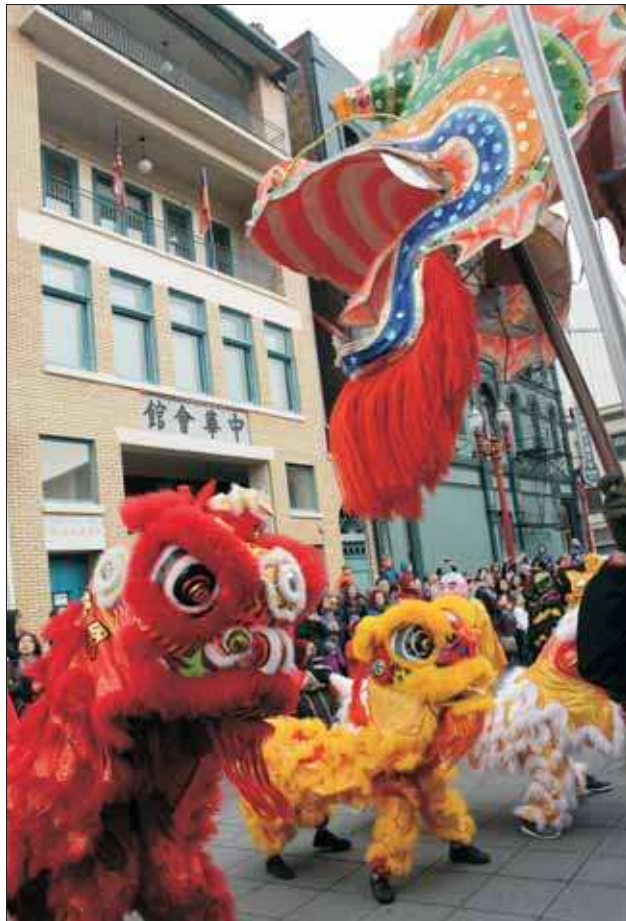
MADE IN CHINATOWN. "Made in Chinatown U.S.A., Portland," the inaugural exhibit of the Portland Chinatown Museum, is on view through September 2. The display features 22 commissioned black-and-white and color images by Seattle photographer Dean Wong featuring the complexity, vibrancy, beauty, and pride of Portland's Chinatown and its people. Pictured are "Chinese Lion Dance Boys," black-and-white digital print, 2016, 16" x 22" (top photo) and "Historic CCBA building, 1944," color digital print, 2017, 16" x 22" (bottom photo).

Assembly Center and later Minidoka. They were released in January 1944 and settled in Chicago. Wesley's talk addresses the plight of women and children at the assembly centers and camps, the loss of civil rights, discrimination, and identity. He plans to also focus on their struggles in relation to the current dangers in our democracy with similar features. For info, call (503) 224-1458 or visit <www.oregonnikkei.org>.