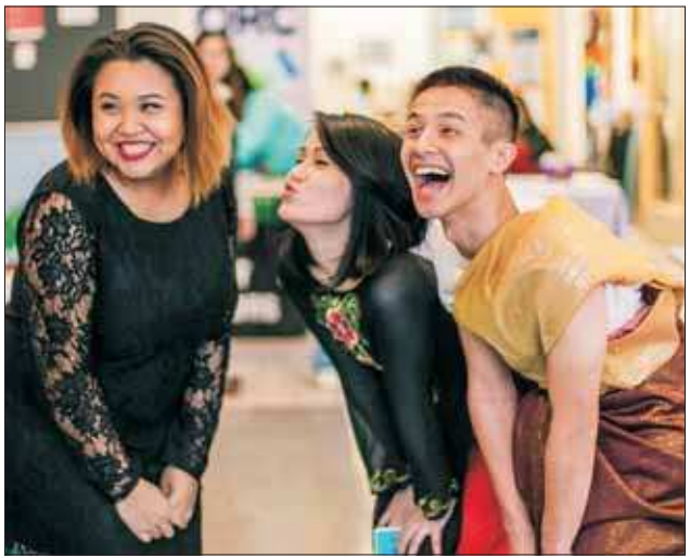
"Multicultural Night" at Portland Community College takes place May 15 on the PCC Southeast Campus.

Read The Asian Reporter – exactly as it's printed here – online! Visit <www.asianreporter.com> and click the "Online Paper (PDF)" link to download our last two issues.