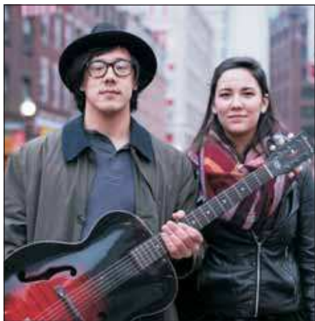
"Gamanfest" takes place May 11-12