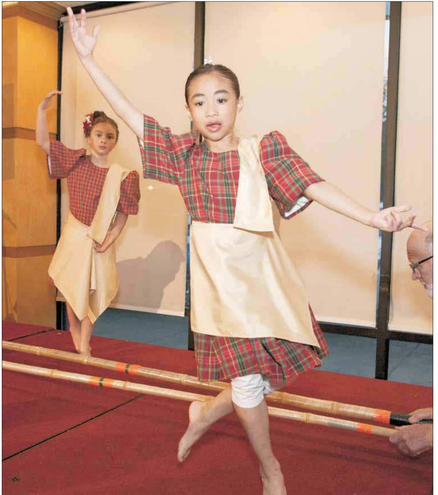
HONORING OUR HERITAGE. Performers with the Filipino American Friendship Club of Oregon entertain attendees by dancing between moving bamboo sticks at The Asian Reporter Foundation's 20th Annual Scholarship & Awards Banquet. The event, held in advance of Asian Heritage Month, featured cultural entertainment and recognized the efforts and accomplishments of area Asian Americans. Our heritage month section begins on page 10.