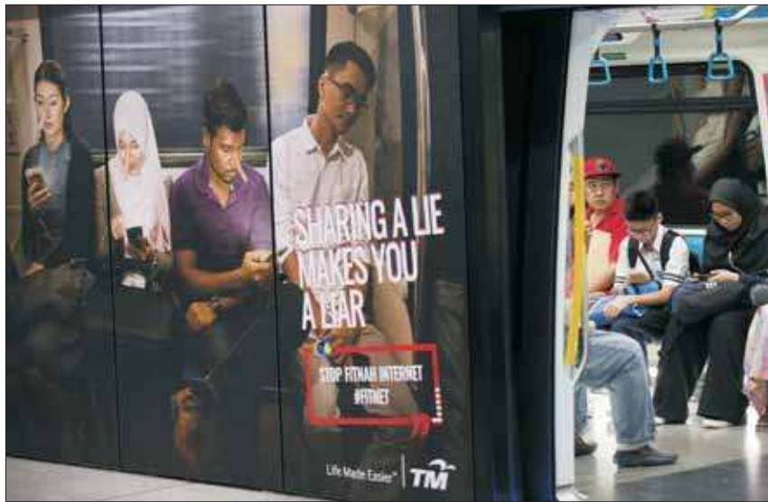
MEDIA MUZZLE? Commuters use their mobile phones inside a train with an advertisement discouraging the dissemination of fake news in Kuala Lumpur, Malaysia. Malaysia's government has cut the proposed punishment for fake news offenders from 10 years to six years in prison following an outcry from rights groups and opposition lawmakers who say the bill aims to silence dissent ahead of a general election.

Azalina Othman, minister in charge of law, said social media such as Twitter and Facebook have acknowledged they are unable to monitor fake news on their platforms. She said the bill gives power to the