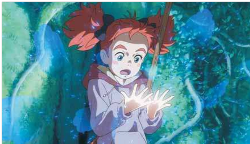
NIPPONESE FILMS. Director Hiromasa Yonebayashi's Mary and the Witch's Flower screens Saturday, April 14 as part of the Northwest Film Center's Japanese Currents film series. The showcase begins April 6 and ends April 28.

From Studio Ponoc, the animation collective featuring several principal artists from the recently shuttered Studio Ghibli, Mary and the Witch's Flower presents a young girl's discovery of an enchanted broom.