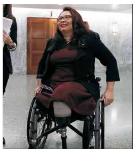
Senator Duckworth is still breaking barriers