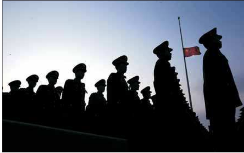
NANKING MASSACRE. Chinese paramilitary policemen stand at attention near a Chinese flag flown at half-mast to mark the 80th anniversary of the Nanking Massacre, held at the Memorial Hall of the Victims in Nanjing. Chinese officials struck a tempered tone on the 80th anniversary of the massacre, saying China would "look forward" and deepen friendship with its neighbor Japan

Denial by conservative Japanese quarters of the country's wartime history has frequently incensed neighbors that bore the brunt of its militarism and colonial rule,