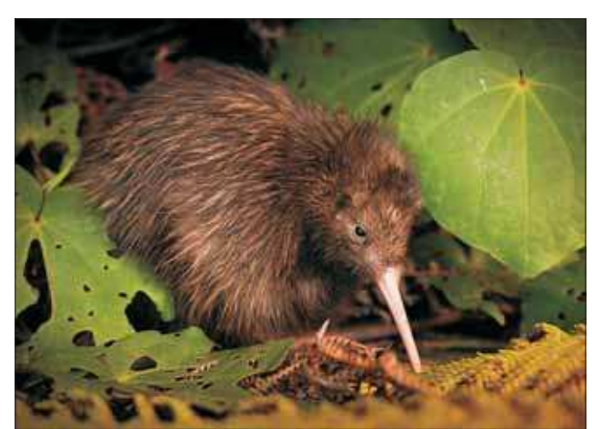
SILVER LINING. This undated photo released by the International Union for the Conservation of Nature (IUCN) shows a Northern Brown kiwi in New Zealand. The global conservation group's recent update mostly included news of grave threats to many species, much of it caused by loss of habitat and unsustainable farming and fisheries practices. However, IUCN said it has upgraded the Okarito kiwi and the Northern Brown kiwi from endangered to vulnerable thanks to progress in controlling predators like weasel-like stoats and cats.