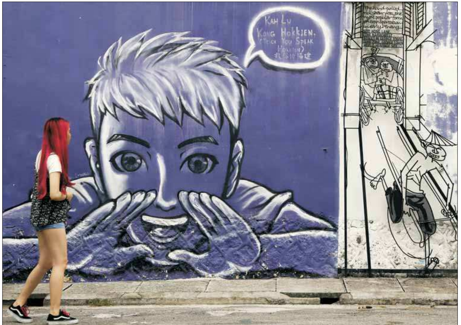
INTRIGUING ISLAND. A woman looks at street art on a wall in George Town on the island of Penang, Malaysia. George Town oozes a hauntingly rustic charm, with colorful street art that is as much a draw as the historical architecture and one of Southeast Asia's tastiest street-food scenes.