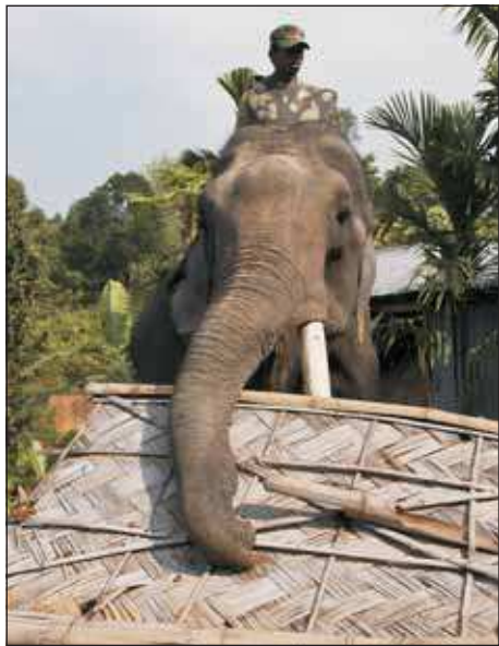
Police use elephants to clear habitat