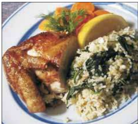
Easy-to-make recipe: Greek-Style Rice Pilaf