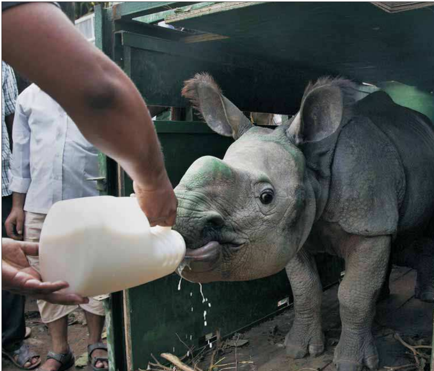
RESCUED RHINO. A female rhino calf drinks milk after arriving at the state zoo in Gauhati, India. One male and two female one-horned rhinoceros calves, who were rescued during monsoon floods over the past two years from a famed wildlife preserve in India's northeast, have been transported to a local zoo for breeding. The three — one and two years old — were put in cages on three different trucks and brought to the zoo from the Center for Wildlife Rehabilitation and Conservation, said Tajas Mariswamy, a regional forest officer.