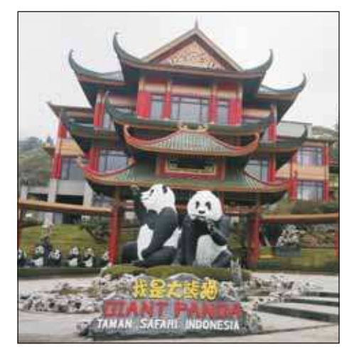
Giant pandas receive welcome in Indonesia

Pacific Northwest News ☐ Volume 27 Number 20 ☐ October 16, 2017 ☐ www.asianreporter.com