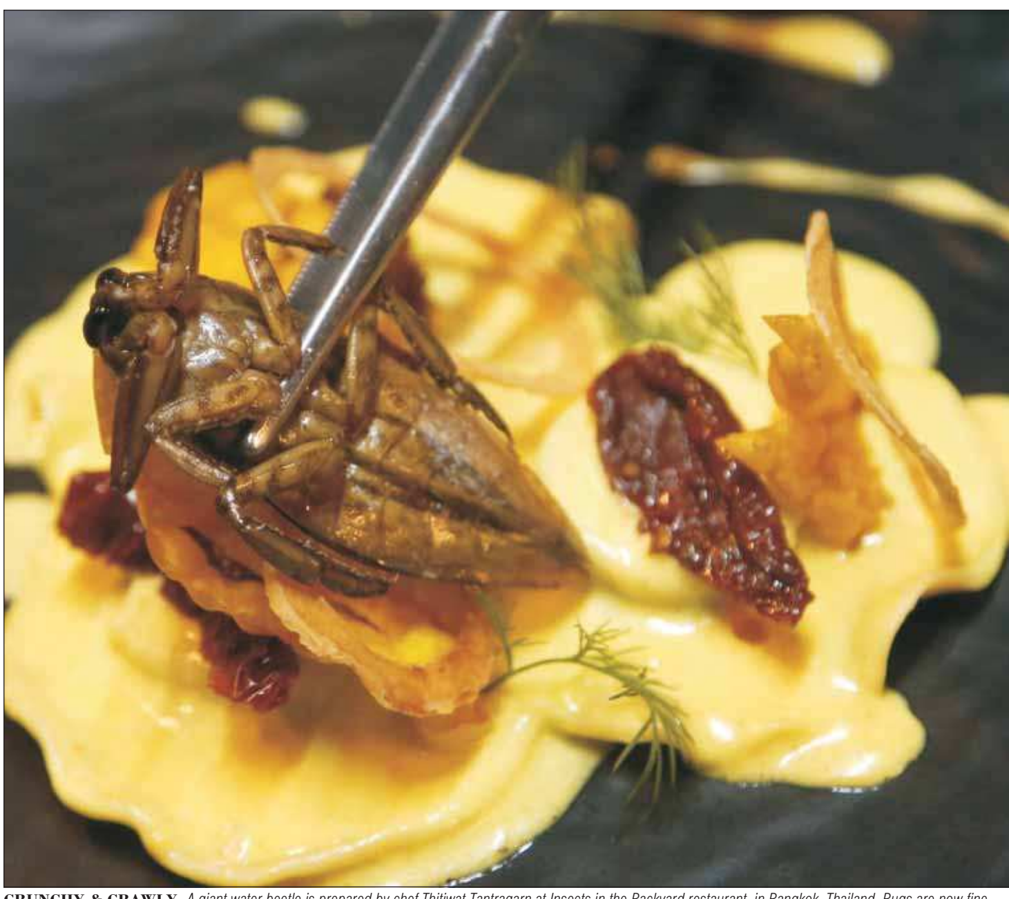
CRUNCHY & CRAWLY. A giant water beetle is prepared by chef Thitiwat Tantragarn at Insects in the Backyard restaurant, in Bangkok, Thailand. Bugs are now fine dining at the Bangkok bistro, which aims to revolutionize views of nature's least-loved creatures and what you can do with them.