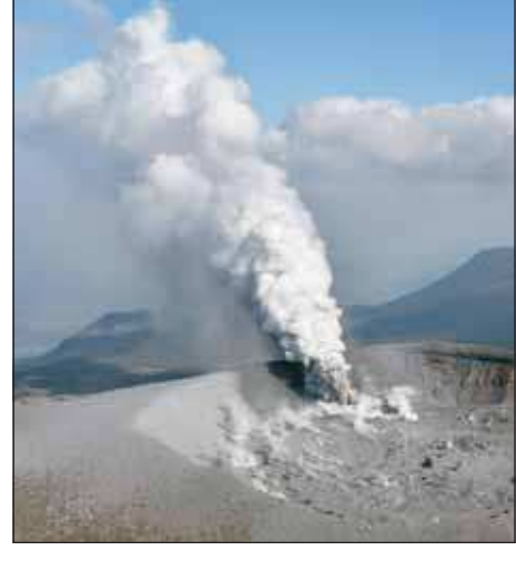
"Ring of Fire" reminds Asia of seismic peril