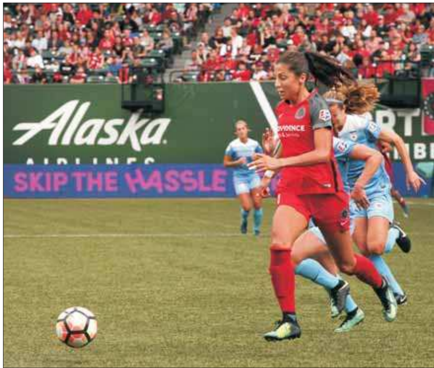
NWSL PLAYOFFS. Nadia Nadim of the Portland Thorns dribbles the ball during the team's final regular-season National Women's Soccer League (NWSL) match against the Chicago Red Stars at Providence Park on September 30, 2017. The Thorns, who finished league play in second place, are hosting a home playoff game for the second year in a row. The semifinal match against the Orlando Pride will be held at Providence Park on Saturday, October 7 at 12:30pm.

includes Nahomi "Naho" Kawasumi, Rumi Utsugi, Megan Rapinoe, and others, ended its season in fifth place with 34 points and an overall record of 9-8-7, missing the playoffs. Naho topped the NWSL assist chart this season with nine.