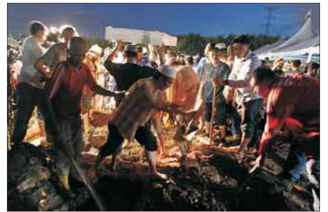
ARSONISTS ARRESTED. Men prepare graves during a mass funeral for some of the victims of a fire at a private Islamic boarding school outside Kuala Lumpur, Malaysia. Officials said the school was operating without a fire safety permit and license, and that a dividing wall was illegally built on the top floor, blocking the victims from reaching a second exit.

Data from the fire department showed that 1,083 fires struck religious schools in the past two years, of which 211 were burned to the ground. The worst disaster occurred in