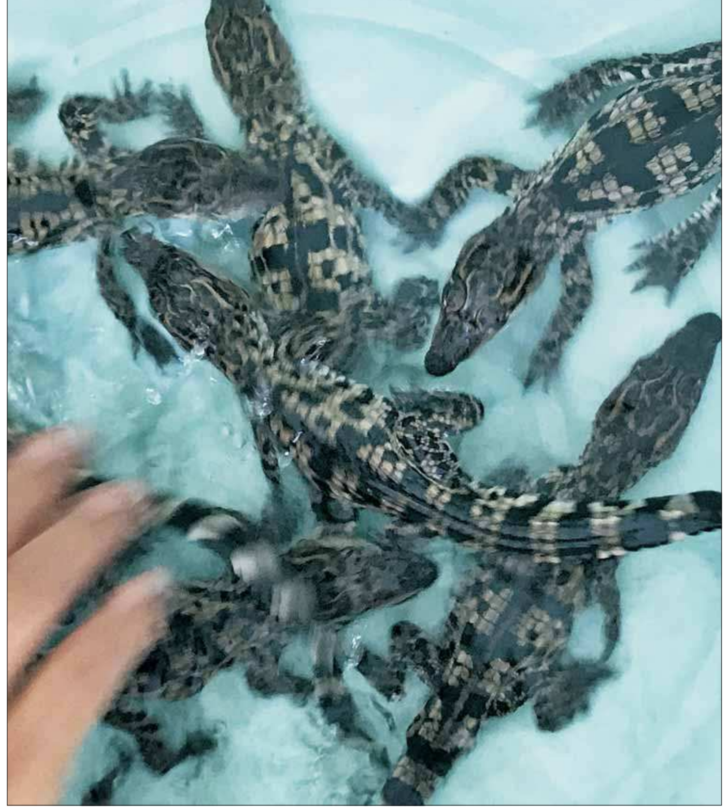
CROCODILE CONSERVATION. Siamese baby crocodiles swim in a bin at the Koh Kong Reptile Conservation Center in Koh Kong, Cambodia. The New Yorkbased Wildlife Conservation Society and Cambodia's Fisheries Administration announced in mid-August that the eggs of nine critically endangered Siamese crocodiles have hatched. The total population of Siamese crocodiles has around 410 wild adults, of which 100 to 300 live in Cambodia, making it the most important country for the conservation of the species. See story on page 5.