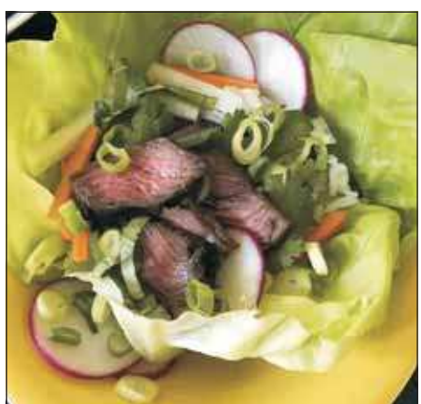
Korean-Style Grilled Short Ribs