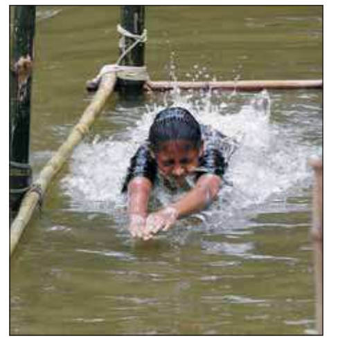
Swim class aims to stop deaths in Bangladesh Page 5

Pacific Northwest News D Volume 27 Number 16 D August 21, 2017 D www.asianreporter.com