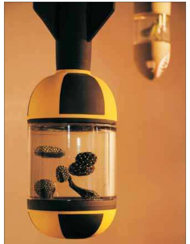
TEARDROPS THAT WOUND. "Teardrops that Wound," a new exhibit on view in Seattle through May 20, 2018, interrogates the narrative of war through a peculiar lens. Pictured is "Bombs Away" (detail), a 2015 piece by Thomas Dang.

"Teardrops that Wound" is on view through May 20, 2018 at the Wing Luke Museum of the Asian Pacific American Experience, located at 719 South King Street in Seattle. To learn more, call (206) 623-5124 or visit <www.wingluke.org>.