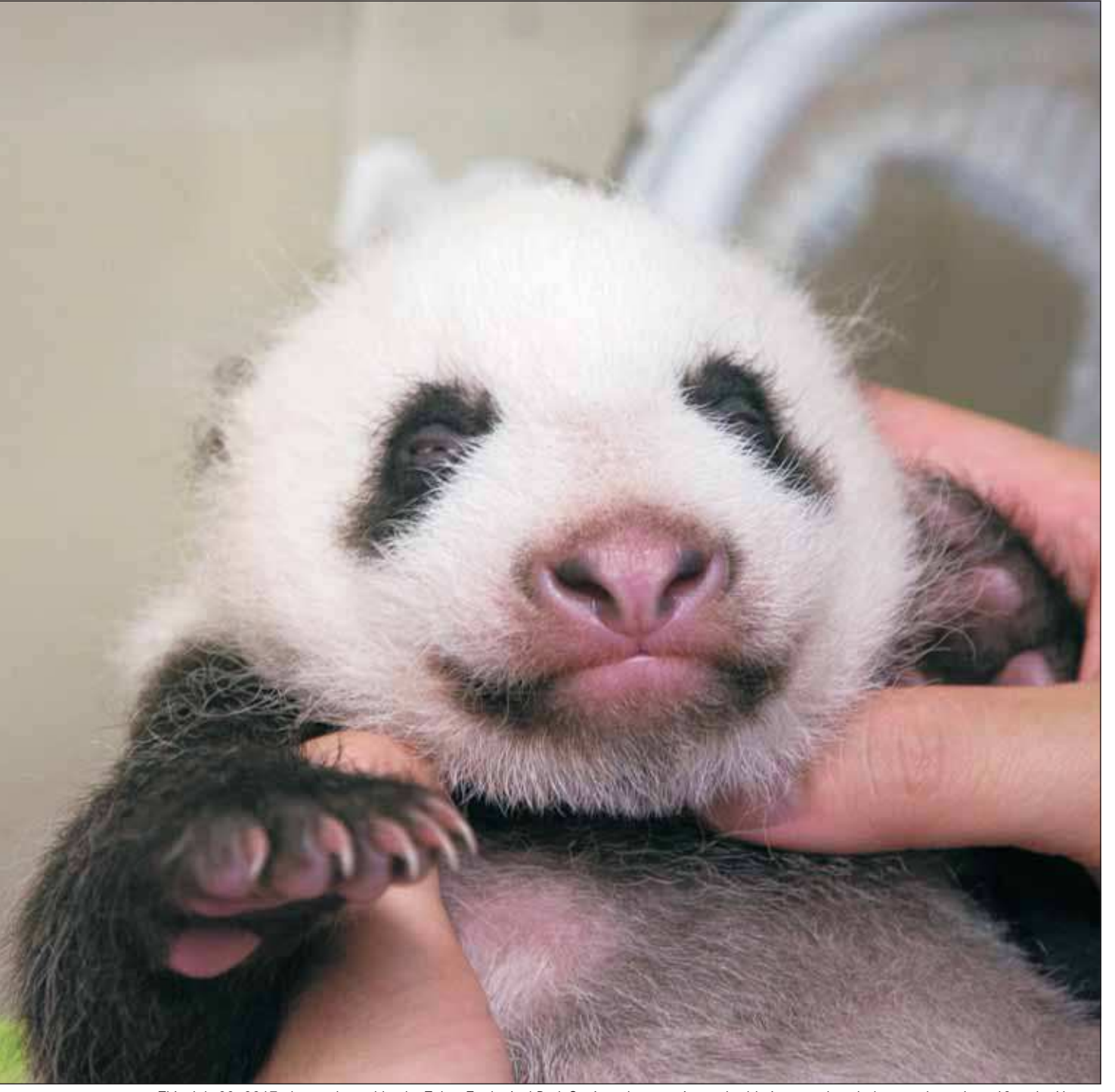
ROLY-POLY CUB. This July 22, 2017 photo released by the Tokyo Zoological Park Society shows a six-week-old giant panda cub that was born June 12 at the Ueno Zoo in Tokyo. Overnight, the baby panda became a celebrity in Japan. The zoo, Japan's oldest, has not yet shown the cub directly to the public, but Tokyo is starting to collect ideas for naming it.