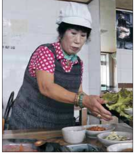
70-year-old grandma is a YouTube hit

Pacific Northwest News D Volume 27 Number 15 D August 7, 2017 D www.asianreporter.com