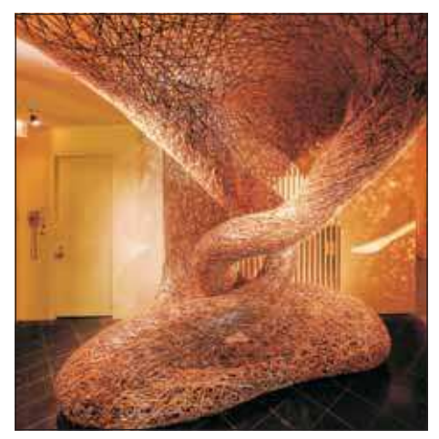
Japan's fine craft of bamboo basketry