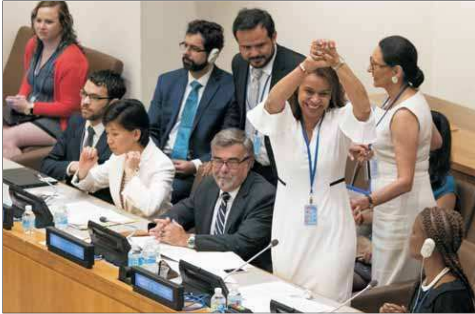
DISARMAMENT DIPLOMACY. Costa Rican ambassador Elayne Whyte Gomez, standing, president of the United Nations Conference to Negotiate a Legally Binding Instrument to Prohibit Nuclear Weapons, reacts after a vote by the conference to adopt a legally binding instrument to prohibit nuclear weapons, hopefully leading to their total elimination, at United Nations headquarters. More than 120 countries approved the first-ever treaty banning nuclear weapons at a U.N. meeting boycotted by all nuclear-armed nations.

A ban that doesn’t address these concerns “cannot result in the elimination of a single nuclear weapon and will not enhance any country’s security,” they said. “It will do the exact opposite by creating