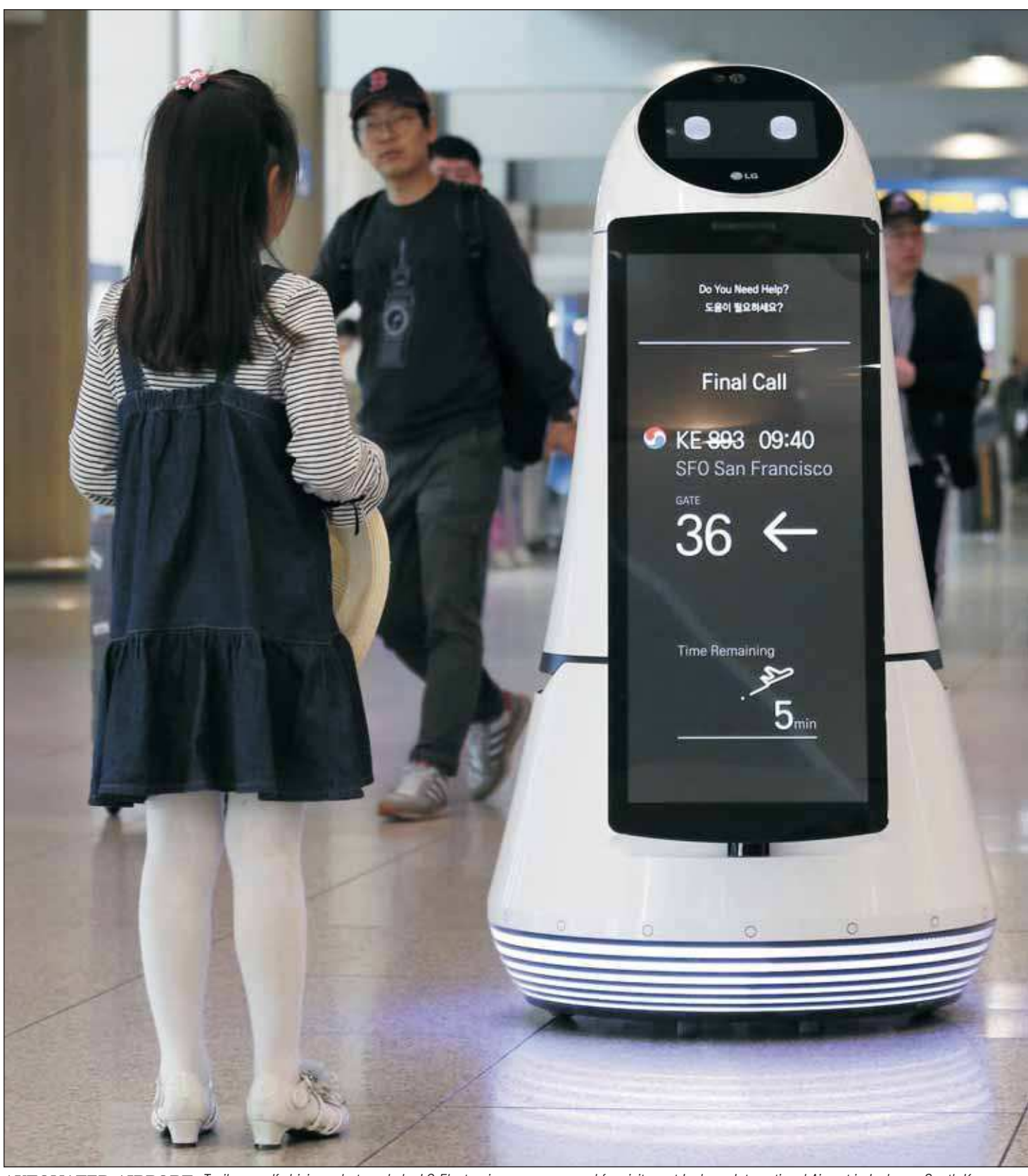
AUTOMATED AIRPORT. Troika, a self-driving robot made by LG Electronics, moves around for visitors at Incheon International Airport in Incheon, South Korea. Troika will rove the airport telling travellers how long it takes to get to boarding gates and escorting them to their flights. A jumbo cleaning robot will help cleaning staff swab the wide expanses of floors in the airport west of Seoul. See story on page 2.