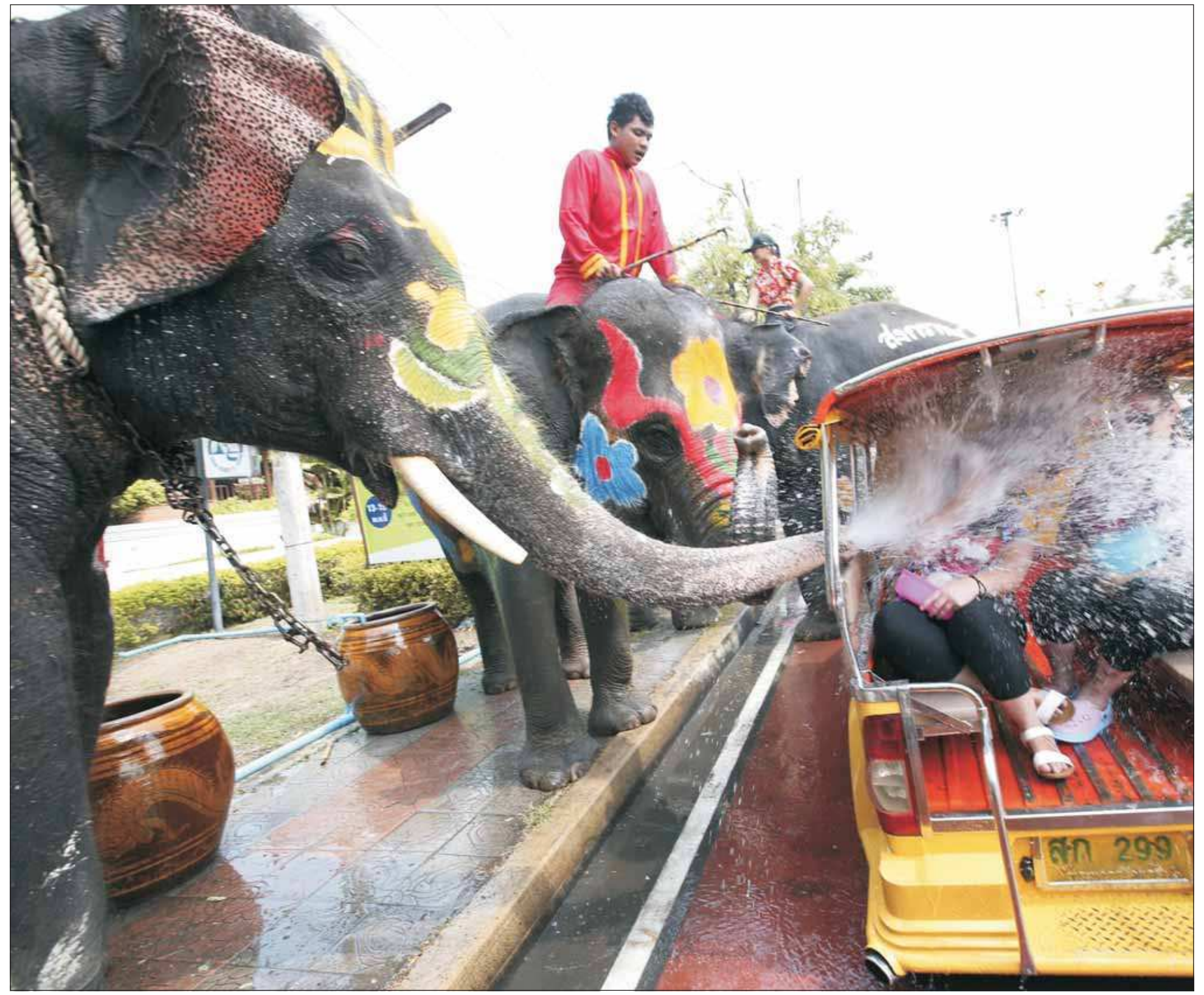
SONGKRAN SOAKING. With assistance from mahouts, elephants blow water from their trunks at tourists on a motor-tricycle, or Tuk Tuk, at Songkran, or the ancient Thai New Year celebration, in Ayutthaya province, central Thailand. The festival — which is also celebrated in neighboring Myanmar, Cambodia, and Laos — falls at the hottest time of the year, when temperatures often creep above 104 degrees Fahrenheit. See story on page 4. Locally in Portland, the third annual Cambodian/Lao/Thai/Burmese "New Year in the Park" takes place Saturday, April 29 from 9:30am to 6:00pm at Glenhaven Park in northeast Portland. See an event listing for the celebration on page 13.