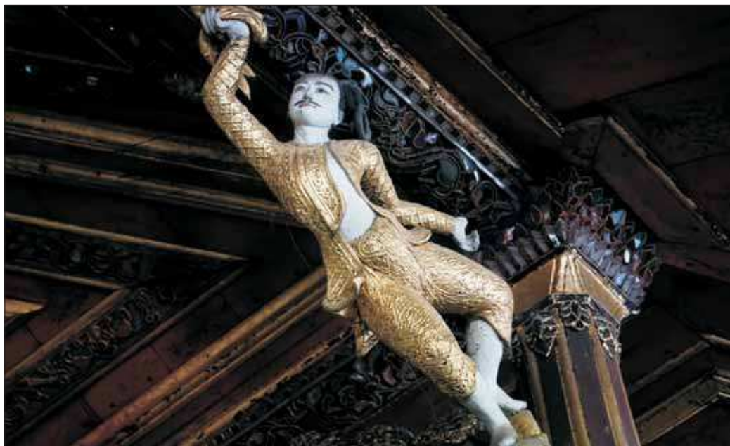
CULTURAL CITY. This January 24, 2017 photo shows one of the exquisite carvings that adorn the palace of Queen Sein Don in Mawlamyine, which depicts one of 45 consorts of Mindon, the next-to-last king of Myanmar (formerly known as Burma). For decades, foreigners were banned from the Mawlamyine area due to an insurgency. Tourists are still few compared to an influx to other areas of the country following the end of military rule in 2011 and the electoral victory of pro-democracy leader Aung San Suu Kyi last year.

BEIJING (AP) — Authorities in China's western region of Xinjiang are offering high salaries and other benefits to recruit police in the restive area, which has seen bloody attacks blamed on separatists. A notice on the website of the government of Kashgar city in Xinjiang said 3,000 male officers are being offered monthly salaries beginning at 5,000 yuan ($724), well above the regional average. The recruitment drive is the latest step to ramp up security in the area, where members of the native Uighur (WEE-gur) ethnic group have been blamed for deadly attacks on government targets and migrants from other parts of China. In a recent reported incident, eight people were killed, including three knife-wielding assailants, in Pishan county in southern Xinjiang. Like in Kashgar, Uighurs form the majority in Pishan.