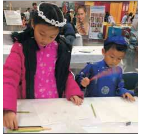
TET FESTIVAL. Partake in Lunar New Year activities at the Vietnamese Community of Oregon's Tet Festival, which is scheduled to take place February 4 at the Oregon Convention Center.

Feb 11, 5pm, Portland State University, Smith Memorial Student Union Ballroom (1825 SW Broadway, Portland). Enjoy dance, music, theatrical performances, and food at the PSU Tet Show, presented by the PSU Vietnamese Student Association. For info, call (503) 725-4452, e-mail <vsa@pdx.edu>, or visit <www.psuvsa.weebly.com>. To buy tickets, call (503) 725-3307.