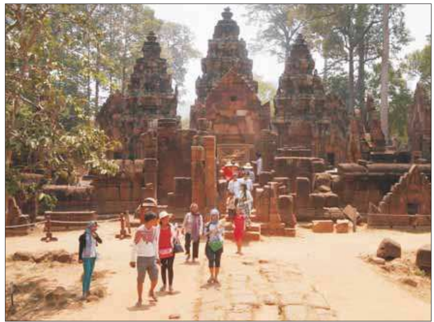
APPROPRIATE ATTIRE ONLY. Tourists walk near Banteay Srey temple at the Angkor complex in Siem Reap province, about 199 miles north of Phnom Penh, Cambodia, in this April 15, 2016 file photo. Visitors who dress immodestly will not be allowed to enter Cambodia's famed Angkor temple complex, the agency that oversees the site has said.

Illustrations of what is considered inappropriate clothing and behavior are posted on the organization's website, an English version of which is still under construction.