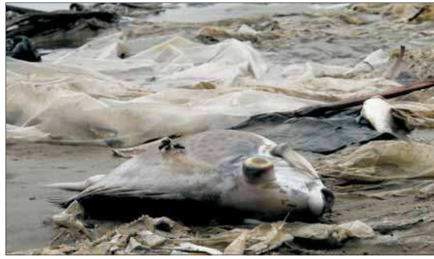
TOXIC EFFLUENT. Dead fish are seen on the shore in Quang Trach district, Quang Binh province, Vietnam. Vietnam's government has announced that Taiwan's Formosa Ha Tinh Steel Corp. was responsible for an estimated 70 tons of dead fish that began washing ashore along more than 125 miles of coastline in four central provinces in early April. The company has pledged to pay $500 million in compensation.

"Our company takes full responsibility and sincerely apologizes to the Vietnamese people ... for causing the