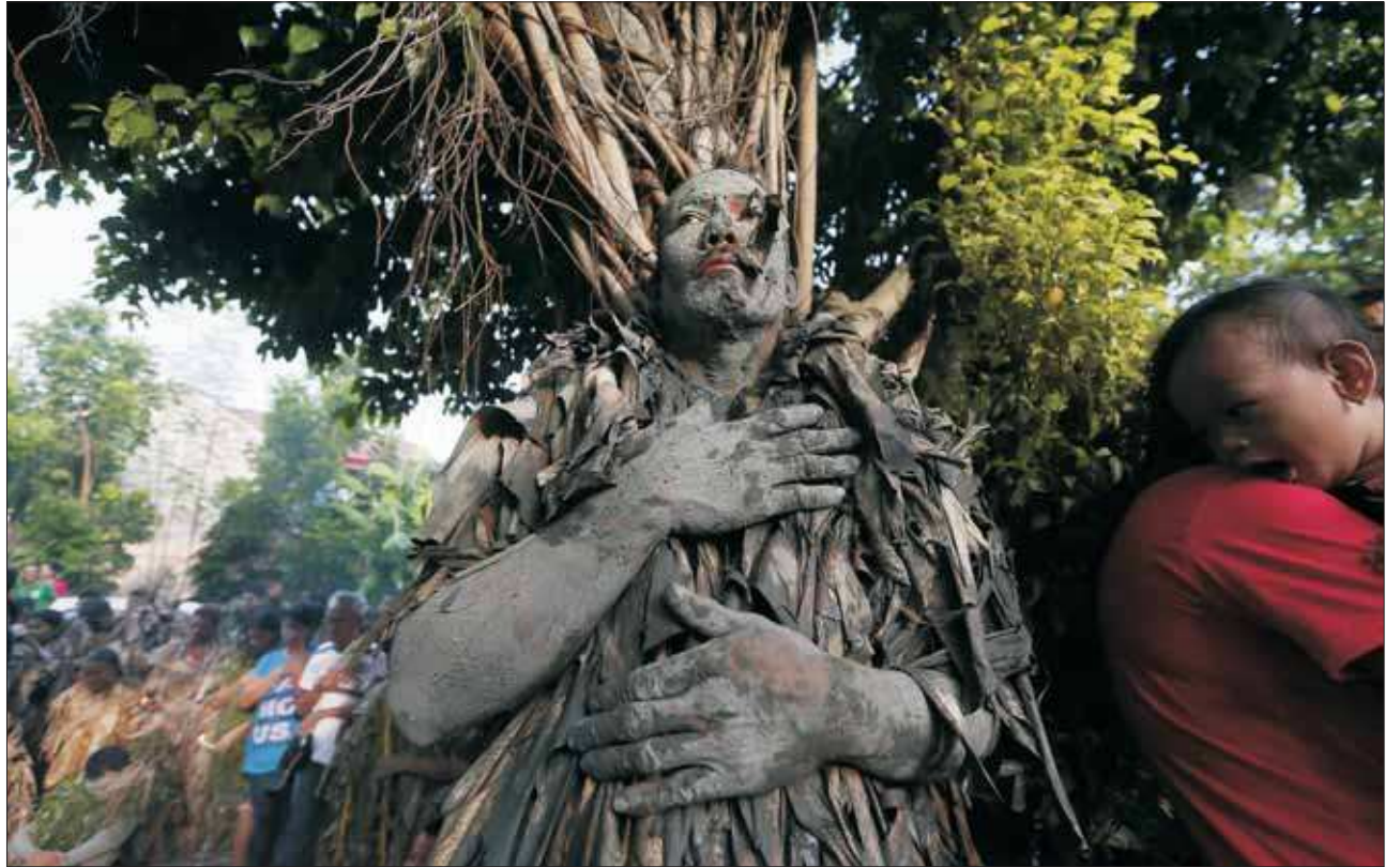
TAONG PUTIK. Villagers — donning capes mostly of dried banana leaves and covered in mud — attend a mass during an annual ritual to venerate their patron saint, John the Baptist, at Bibiclat, Aliaga township, Nueva Ecija province in the northern Philippines. The Taong Putik or “mud people” festival in Bibiclat village dates back to the Japanese occupation of the Philippines in the 1940s.

During the festival, men, women, and children — some covered with capes from head to foot and with eyes peering from a cake of mud — collect candles from villagers along Bibiclat’s main street on their way to St. John the Baptist’s church to hear mass. They light the candles and make wishes.