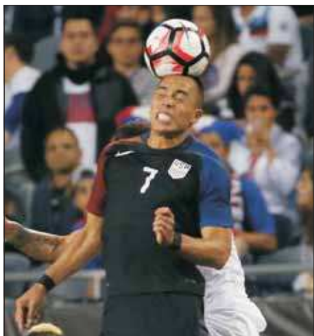
Team USA striker Bobby Wood