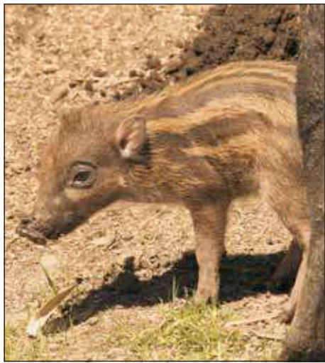
Endangered piglet born at the Oregon Zoo