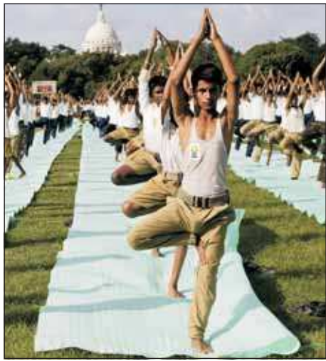
Millions exercise during global Yoga Day

Pacific Northwest News □ Volume 26 Number 13 □ July 4, 2016 □ www.asianreporter.com