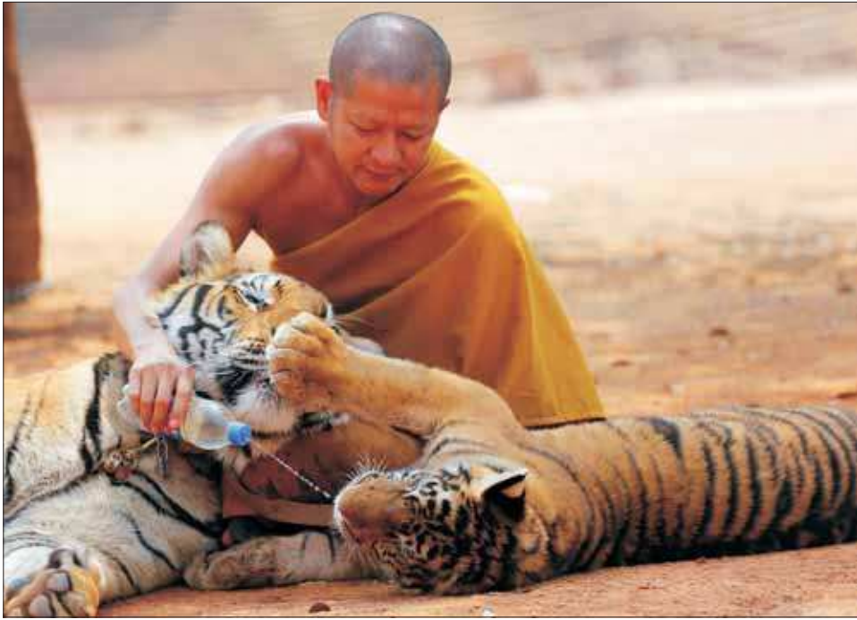
TIGERS IN TROUBLE. A Thai Buddhist monk gives water to a tiger from a bottle at the "Tiger Temple" in Saiyok district in Kanchanaburi province, west of Bangkok, Thailand, in this February 12, 2015 file photo. A Buddhist temple has denied that its abbot was involved in illegal trafficking of tigers at a news conference that was its first detailed response since Thailand's wildlife authority removed scores of big cats from the popular tourist attraction and found dead cubs in jars and freezers.