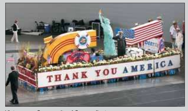
Vietnamese Community of Oregon float