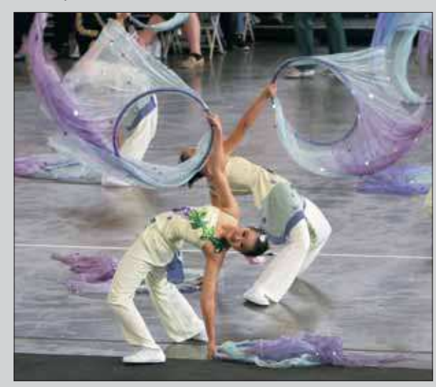
Shu-Te Home Economics & Commercial High School ( Taiwan ) participants