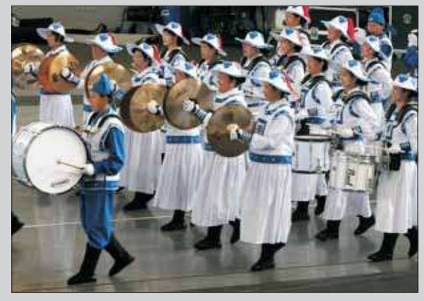
Tianguo (Falun Dafa) Marching Band (San Jose & Vancouver, B.C.)