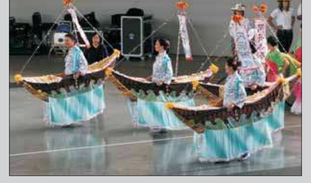
Northwest Chinese Alliance participants