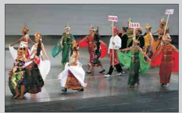
Indonesian Community of Oregon participants

Oregonians about imposter scams include if the caller: and fraudulent phone calls. • Asks you to wire money or buy a