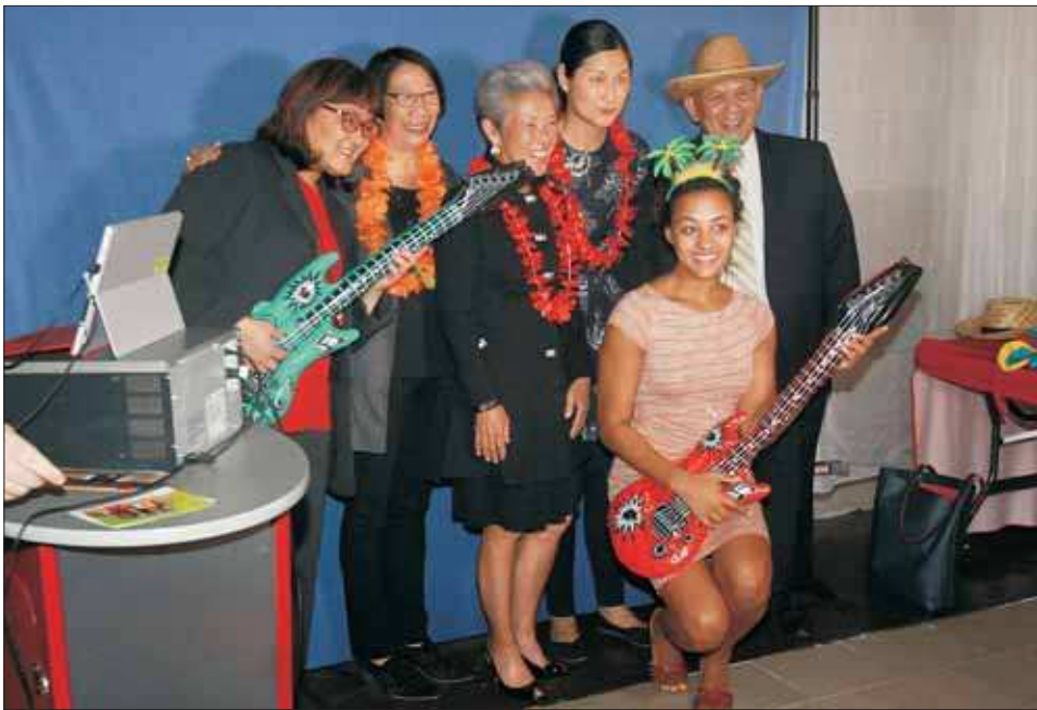
TEACHING THE TINKLING. Dancers with the Filipino American Friendship Club of Oregon teach the "Tinkling" to members of the audience (top photo) at The Asian Reporter Foundation's 18th Annual Scholarship & Awards Banquet. Also referred to as the "stick dance," the performance features 10-foot-long bamboo poles clacking together as well as on the floor beneath — while the dancers graciously touch their toes between the quickly moving bamboo. Pictured in the bottom photo are banquet attendees posing for a group shot at the photo booth.