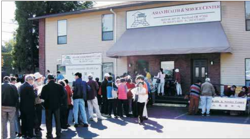
NEW FACILITY NEEDED. The Asian Health & Service Center (AHSC) is working toward moving to a new permanent home. The organization, founded in 1983 as the Chinese Social Service Center, originally occupied 600 square feet in the basement of the Chinese Presbyterian Church in southeast Portland (top photo). In 1999, AHSC moved to a 3,000-square-foot building on S.E. 35th Place (bottom photo); in 2002, the center took up 9,000 total square feet within the same building.

anticipates that demands for service will increase over the foreseeable future. AHSC predicts over the next 10 years that Portland's Asian population will increase by 47 percent.