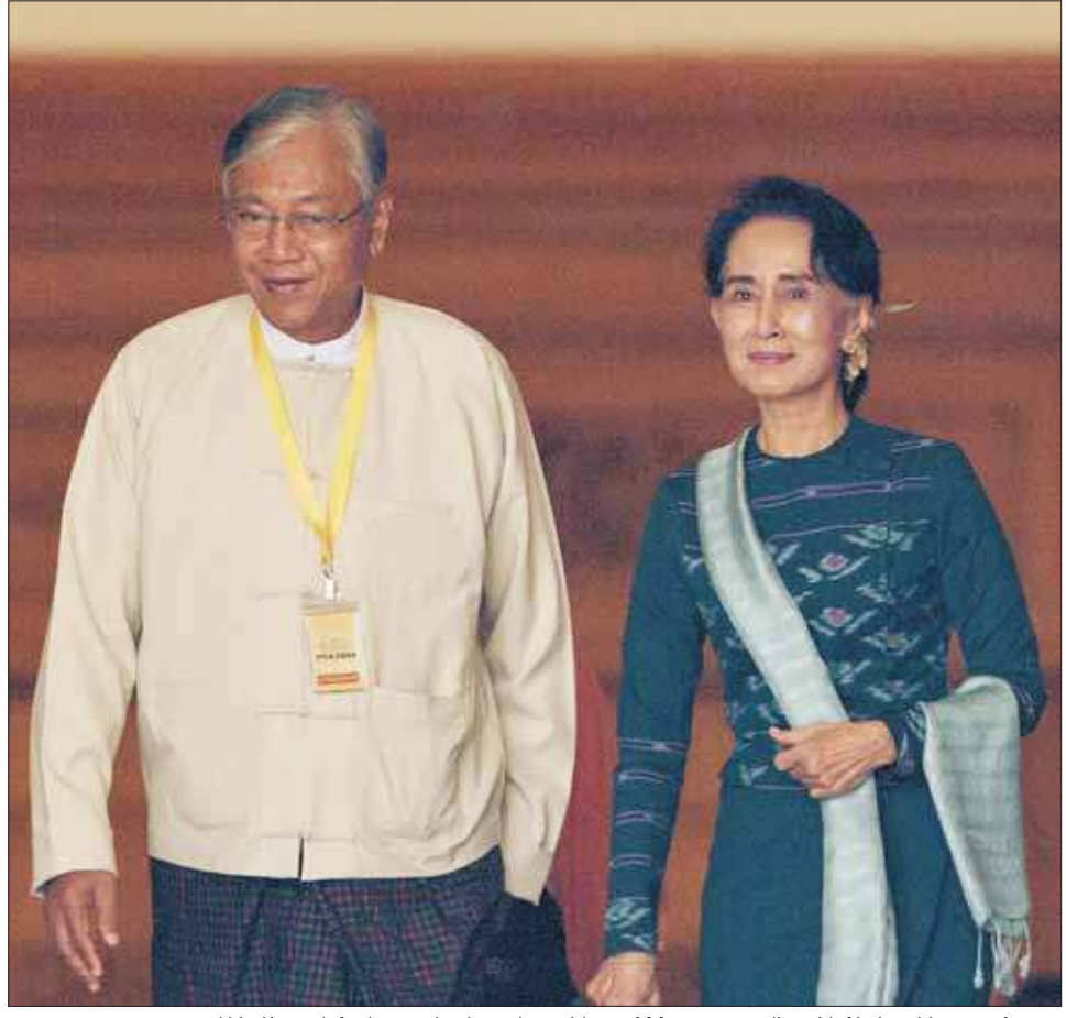
NLD PREVAILS. Htin Kyaw, left, the newly elected president of Myanmar, walks with National League for Democracy leader Aung San Suu Kyi, right, at parliament in Naypyitaw, Myanmar. The country's parliament elected Htin Kyaw as the new president in a watershed moment that ushers the longtime opposition party of Suu Kyi into government.