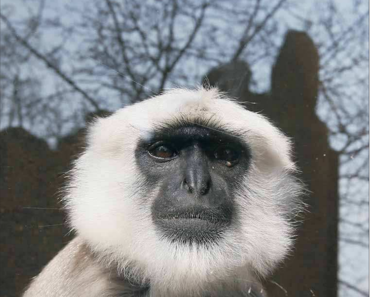
INDIA IN ENGLAND. A Hanuman Langur monkey looks through a glass enclosure, part of the new Land of the Lions display in London, on March 17, 2016. The Queen and Prince Philip visited London to view the exhibit, which will transport visitors from the heart of London to India's vibrant Sasan Gir, where they can take a closer look at the mighty Asiatic lions, when it opens officially in April. Guests are able to traverse three walkways that cover the 2,500-square-meter exhibit, which also features an India-themed train station, crumbling temple clearing, high street, and guard hut.