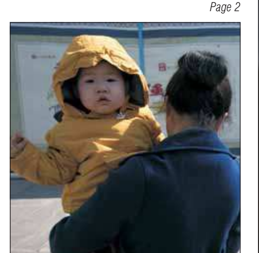
China will not allow unlimited children