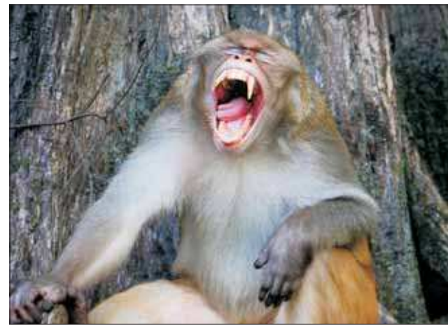
PRIMATE PROLIFERATION. An alpha male called King Phillip, or Snaggle Tooth — because of his right fang hanging over his lower lip — displays a "threat call" along the shoreline of the Silver River in Florida's Silver Springs State Park, in this photo taken on September 17, 2013. The population of monkeys native to Asia appears to be spreading in central Florida, according to researchers.

Weeks later, a homeowner reported seeing a monkey in a tree in her backyard in The Villages. It sat upright in the tree,