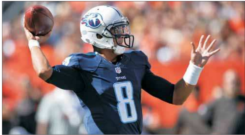
ROOKIE SEASON. Tennessee Titans quarterback Marcus Mariota (#8) throws a 19-yard touchdown pass to tight end Anthony Fasano during the second half of a National Football League (NFL) game in Cleveland, in this September 20, 2015 file photo. Mariota's inaugural NFL season ended two games early due to a knee injury. The rookie quarterback threw for 2,818 yards with 19 touchdowns and 10 interceptions despite being sacked 38 times.