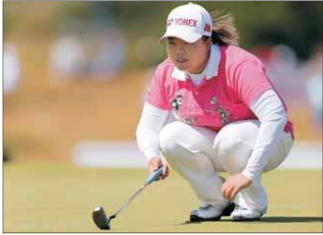
SUPERIOR STROKES. South Korea's Sun-Ju Ahn lines up a putt on the 9th green during the final day of the women's British Open golf championship at the Royal Birkdale Golf Club in Southport, England, in this July 13, 2014 file photo. Ahn recently won the Toto Japan Classic for her first Ladies Professional Golf Association Tour victory and 20th Japan LPGA title.