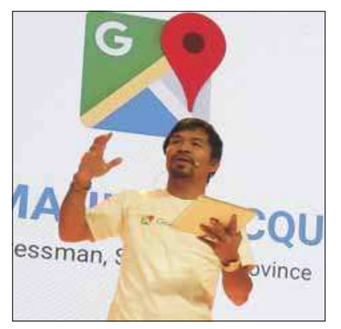
Pacquiao says Street View will help tourism