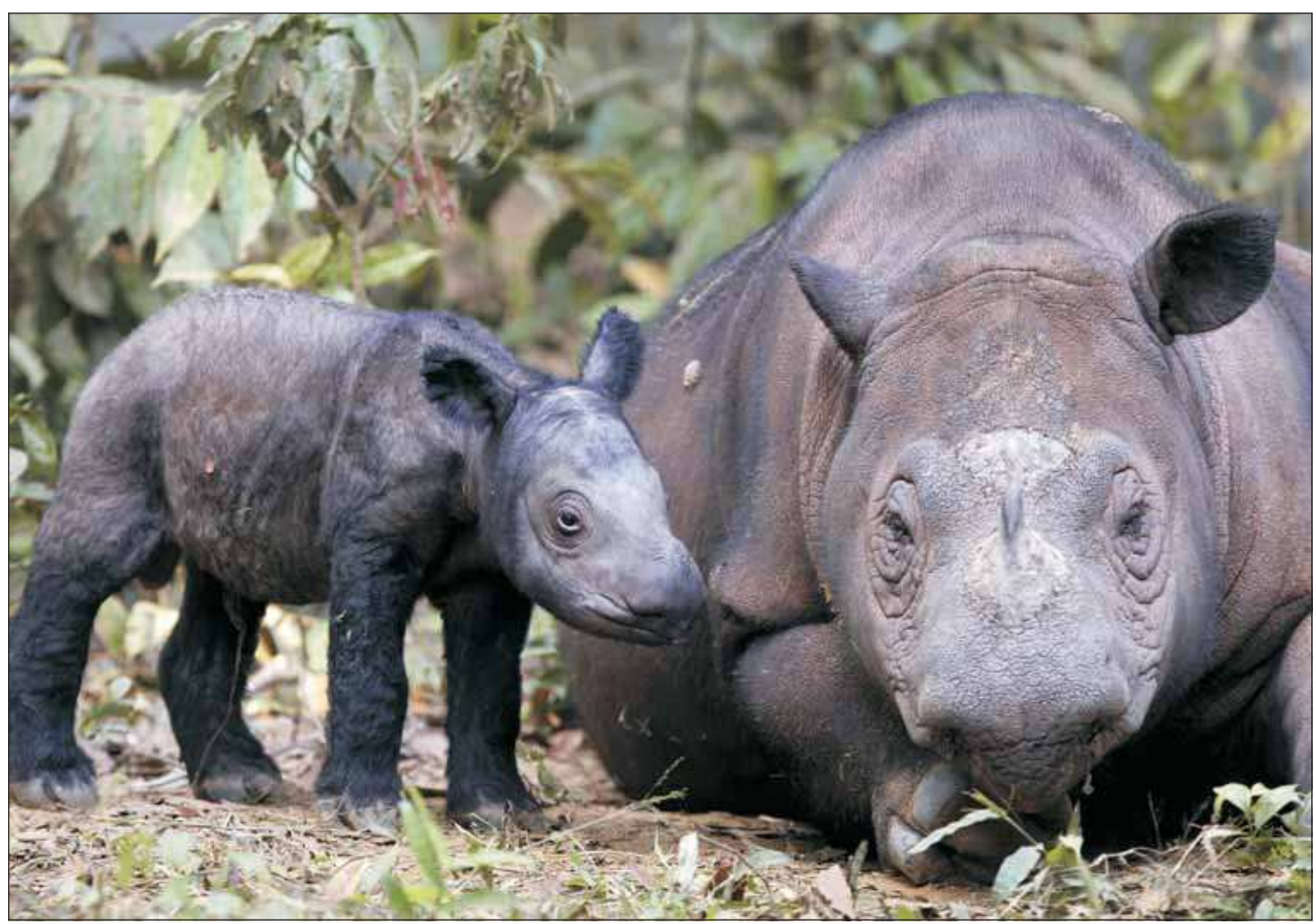
RARE RHINO. In this June 25, 2012 file photo, Ratu, right, a female Sumatran rhino, is seen with her newly born calf at Way Kambas National Park in Lampung, Indonesia. Ratu is pregnant with her second calf at an Indonesian sanctuary in the original habitat of the highly endangered species, according to a government conservation official.

Highly endangered Sumatran rhino pregnant with second calf