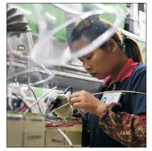
Robot revolution sweeps factory floors

Pacific Northwest News ☐ Volume 25 Number 19 ☐ October 5, 2015 ☐ www.asianreporter.com