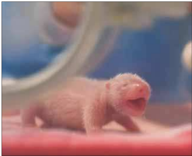
CUTE CUB. A panda cub born at the Chengdu Research Base of Giant Panda Breeding in Chengdu, the capital of southwest China's Sichuan province, is seen on June 23, 2015. The first panda twin cubs of the year met the public for the first time a day after they were born.