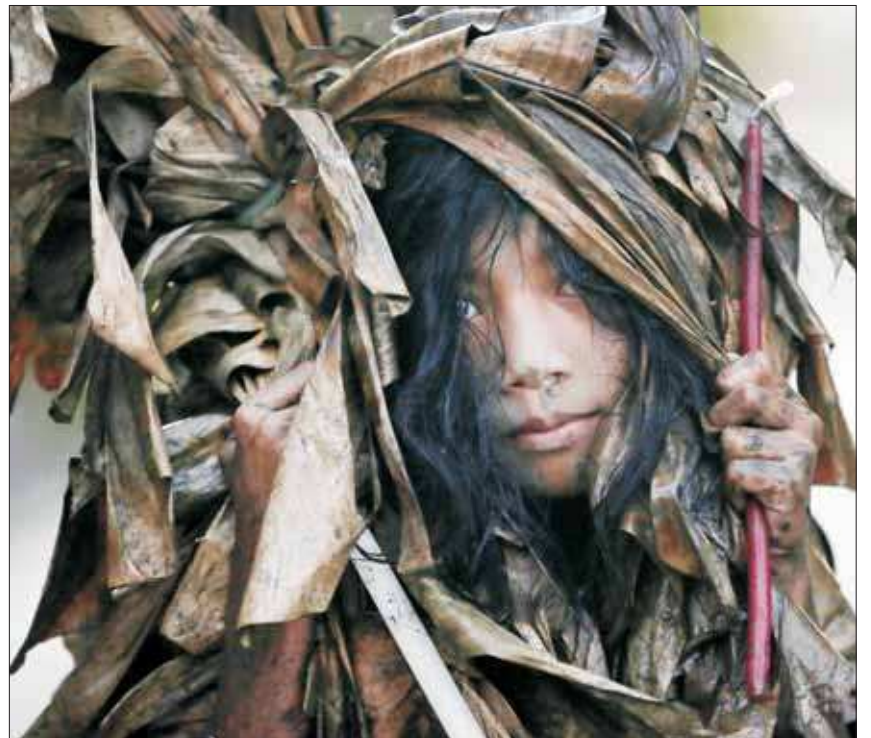
CANDLES & CAPES. A muddied girl donning a cape made of dried banana leaves collects candles before attending a mass to celebrate the Feast Day of St. John the Baptist in the village of Bibiclat, Aliaga township, Nueva Ecija province, in the northern Philippines. At dawn every June 24, people from Bibiclat village pay homage to their patron saint, John the Baptist, by gathering in silence in a swampy field to cover themselves in mud, donning mud-drenched capes made of dried banana leaves.

During the festival, men, women, and children — some covered with capes from head to foot, eyes peering from a cake of mud on their faces — collect candles from bystanders along