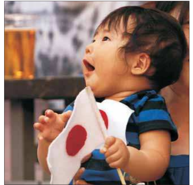
SUPERFANS. Team Japan is in Group C with Cameroon, Ecuador, and Switzerland. The Nadeshiko have experienced great fan support already in the tournament, with nearly 26,000 attending the Switzerland match held at BC Place. Japan plays Ecuador on Tuesday, June 16 before heading to the Round of 16 knockout stage.

make it to the Round of 16, with games held June 20 to 23.