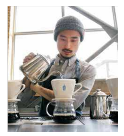
Blue Bottle brews long queues in Tokyo

Pacific Northwest News ☐ Volume 25 Number 11 ☐ June 1, 2015 ☐ www.asianreporter.com