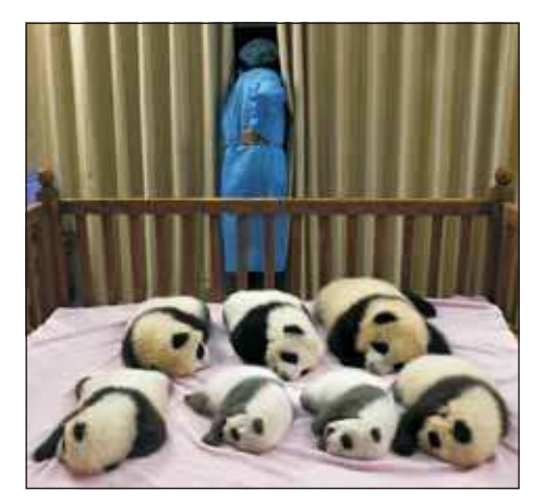
Wild giant panda population increases

Pacific Northwest News ☐ Volume 25 Number 6 ☐ March 16, 2015 ☐ www.asianreporter.com