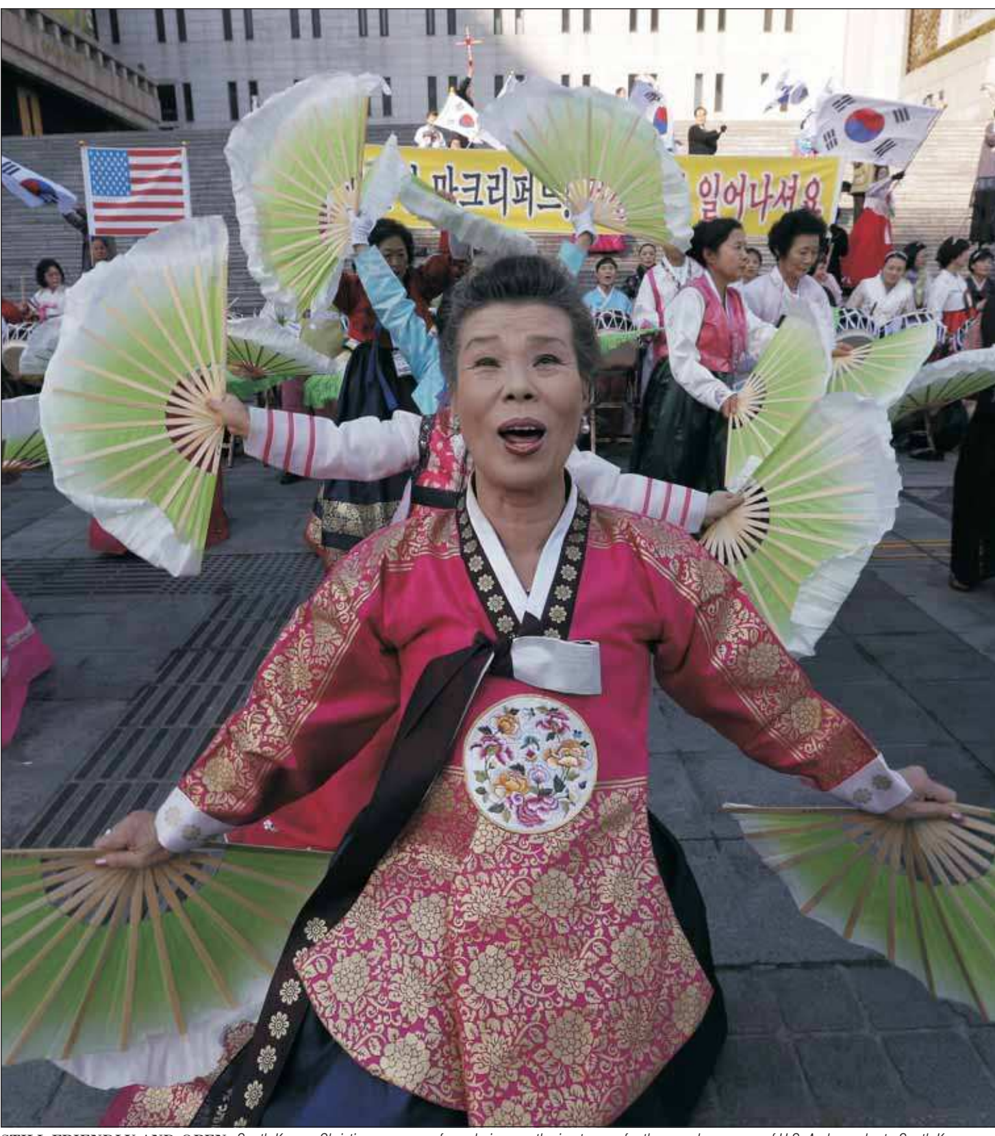
STILL FRIENDLY AND OPEN. South Korean Christian women perform during a gathering to pray for the speedy recovery of U.S. Ambassador to South Korea Mark Lippert near the U.S. embassy in Seoul, South Korea. Ambassador Lippert vowed not to change his "open and friendly" approach to diplomacy as he left a South Korean hospital five days after being attacked by a knife-wielding man screaming about Korean unification. Media images of the bleeding ambassador shocked many in South Korea, a strong U.S. ally, and caused an outpouring of public sympathy. See story on page 5.