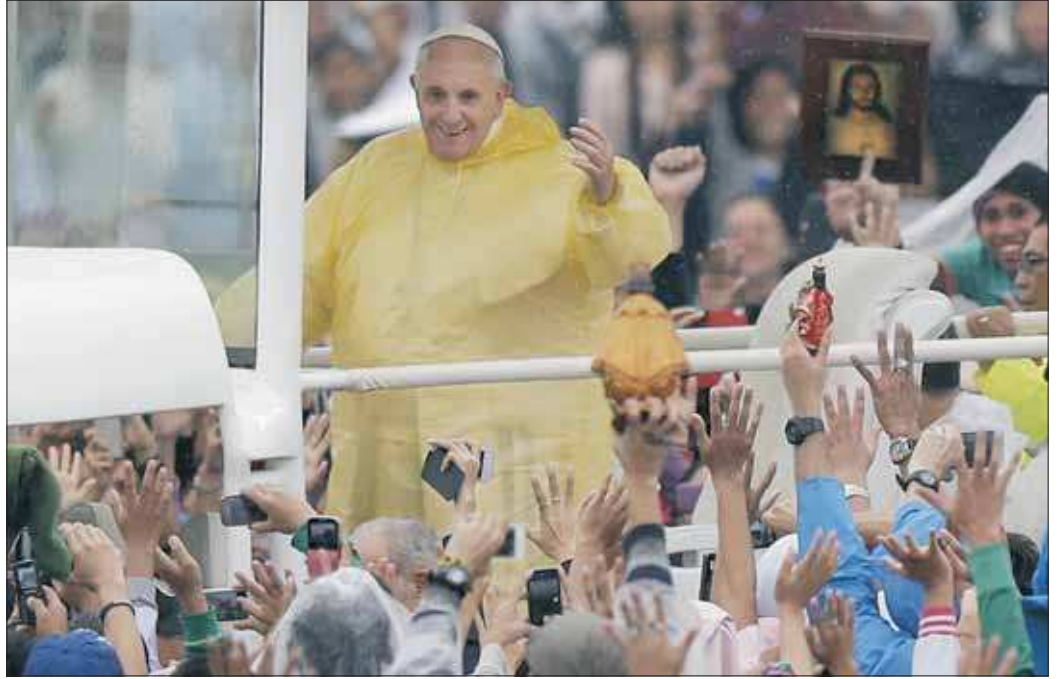
PAPAL VISIT. Pope Francis waves to the faithful as he arrives at Rizal Park to celebrate mass in Manila, the Philippines, on January 18, 2015. Millions filled Manila’s main park and surrounding areas for his final mass in the Philippines, braving a steady rain to hear the pontiff’s message of hope and consolation for the Southeast Asian country’s most down-trodden and destitute.

BEIJING (AP) — Chinese police have arrested more than 110 people on suspicion of selling pork from diseased pigs in the country’s latest food safety scandal. The Public Security said in a statement that more than 1,000 tons of contaminated pork and 48 tons of cooking oil produced from the meat had been seized in the operation that began last year across 11 provinces. The ministry said the suspects belonged to 11 different syndicates who purchased pigs that had died of disease from farmers at cut-rate prices then processed them into bacon, ham, and oil. It said the producers sourced the pigs by bribing government livestock insurance agents, several of whom were also sent for prosecution. A series of scandals in China have deeply undermined public trust in food safety.