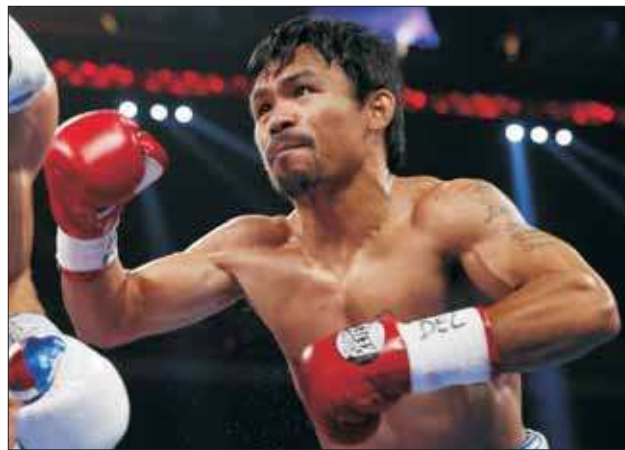
SUPERFIGHT. World Boxing Organization welterweight champion Manny Pacquiao of the Philippines fights during his world welterweight title boxing match at the Venetian Macao last year. Floyd Mayweather Jr. wants to fight Pacquiao, according to a top Showtime executive, and negotiations for a May 2 bout continue.